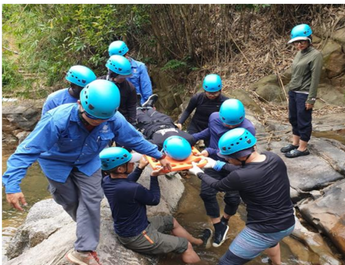
Casualty Evacuation training @ Lightning Stream

Developing base activities for clients who are due to arrive at the turn of the season while maintaining currency in activities such as abseiling and caving. An exciting new challenge awaits participants in Ha Long, in the form of what has been aptly named Lightning Stream. These activities are made possible with on-going collaboration and support from the local land-owners.