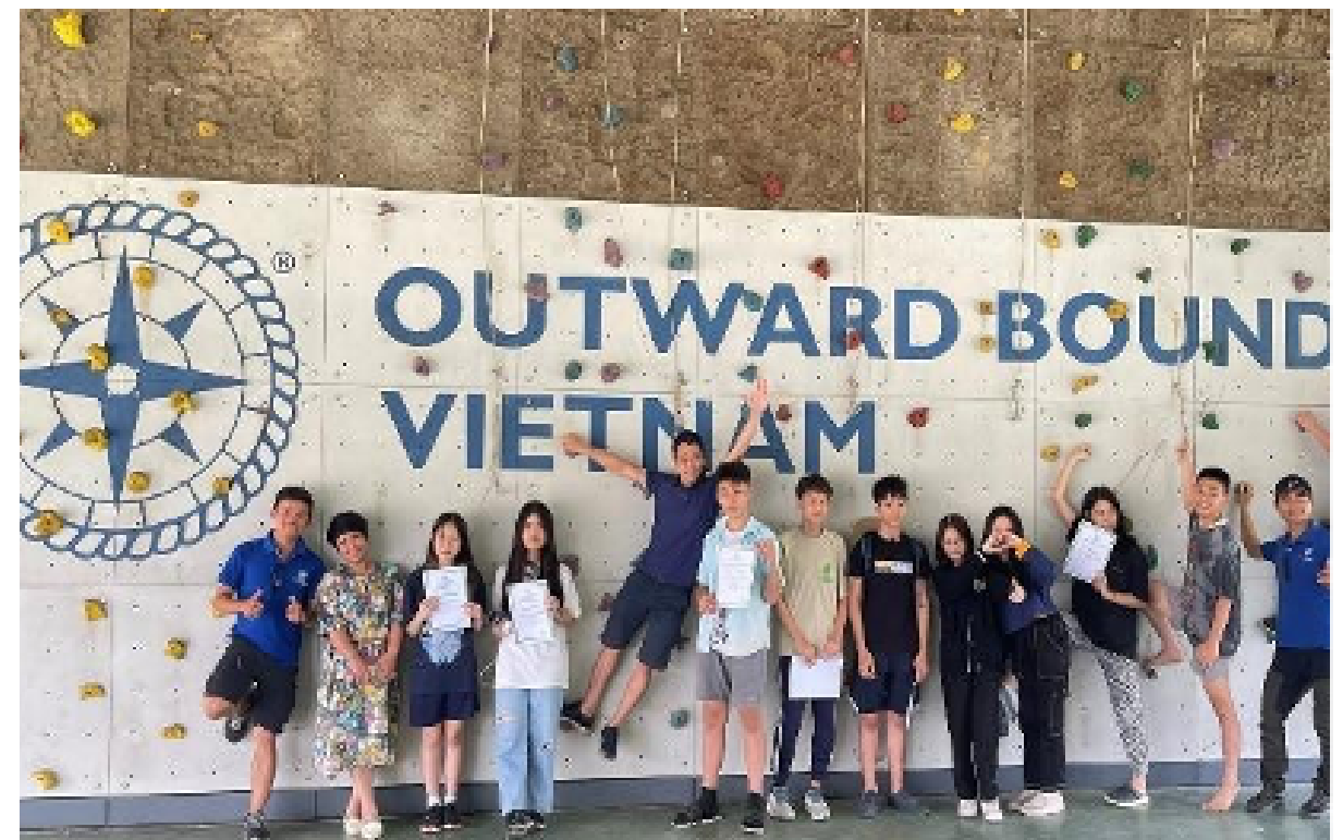
OBV Certificate Awarding Ceremony for TDS students