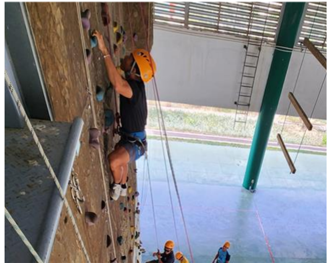
Indoor abseil and rockwall training

Staff in Ha Long has been maximising their time in the blistering summer period with skills development and base projects to enhance both the site and skills, giving meaning to the saying Form and Function.