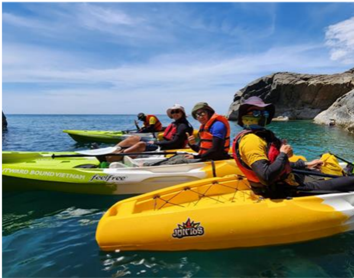
Sit on top Kayak personal skills training

Exploring Local sites such as the Cham Towers, Quy Nhon Science Centre, and collaborative work with Nga Foundation to deliver environmental and service-focused projects were among the highlights and perk of staff trainings in the outdoor environment rich in learning values.