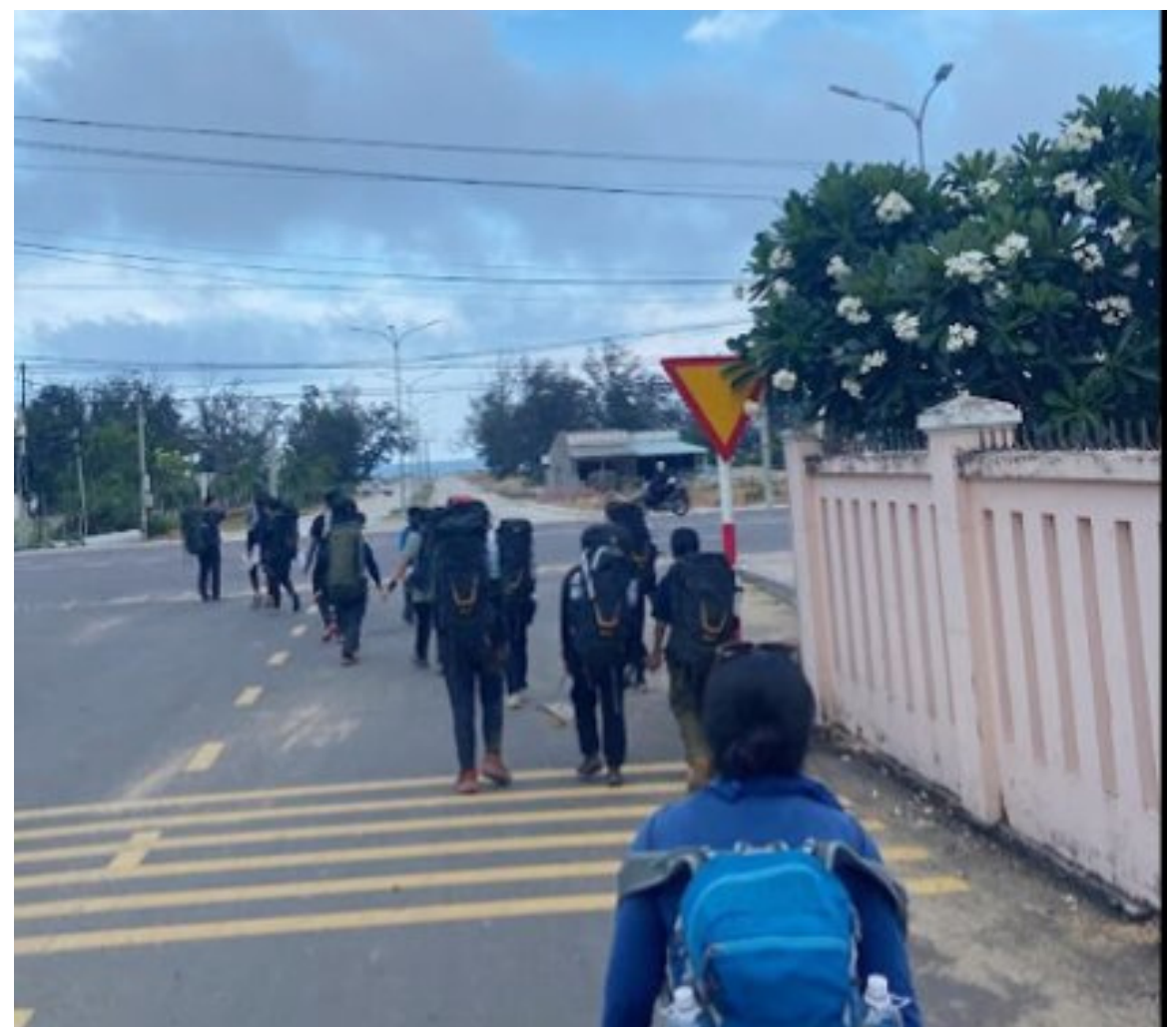
RP interns bringing participants on expedition