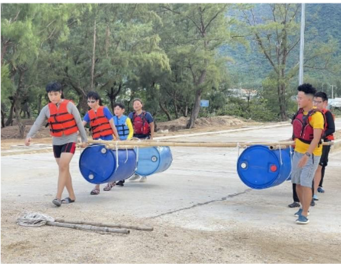
Students cooperating during the raft building challenge

From 24 - 27 July 2023, Outward Bound Vietnam provided experiential courses for students from grade 6 to grade 9 from Wellspring Bilingual School with 5 days of journey-style and centre-based experience in Binh Dinh. Through a variety of team initiatives, indoor rock climbing, hiking, and raft building, the dynamics of the group and their ability to communicate with one another helped students build empathy and understanding of others' needs. This developed a greater sense of appreciation among students, as well as providing an opportunity to give back to communities around them.