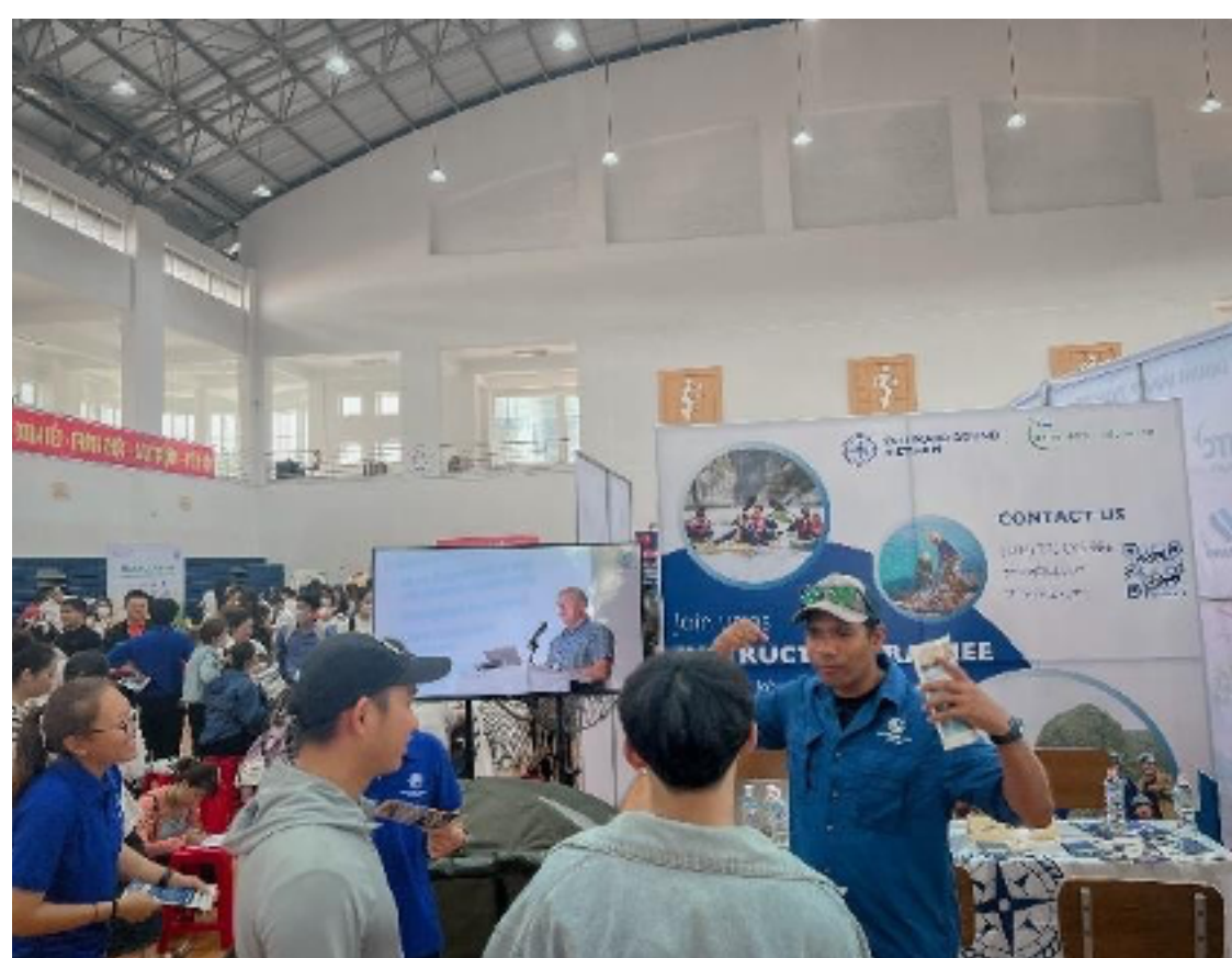
OBV Team attending Quy Nhon University Job Fair, May 2023