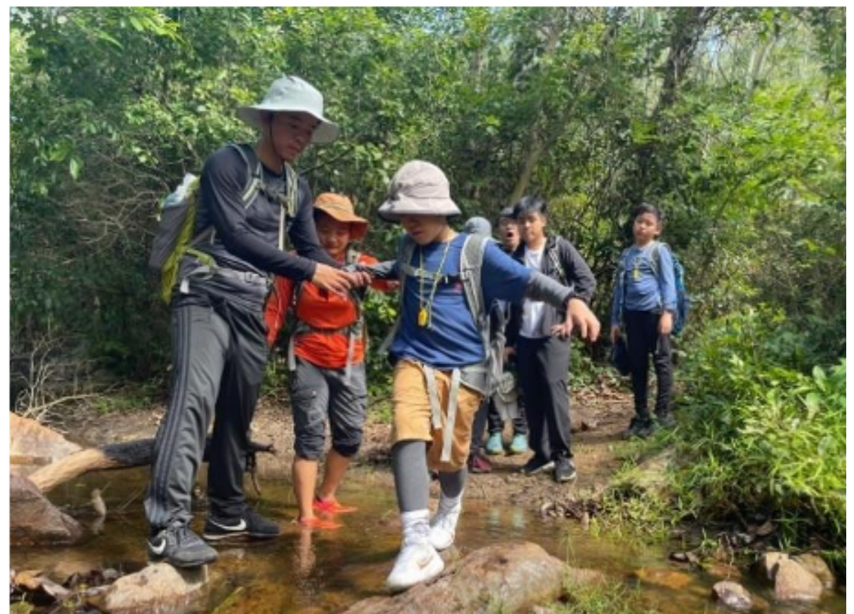
Wellspring Bilingual Students during hiking activity