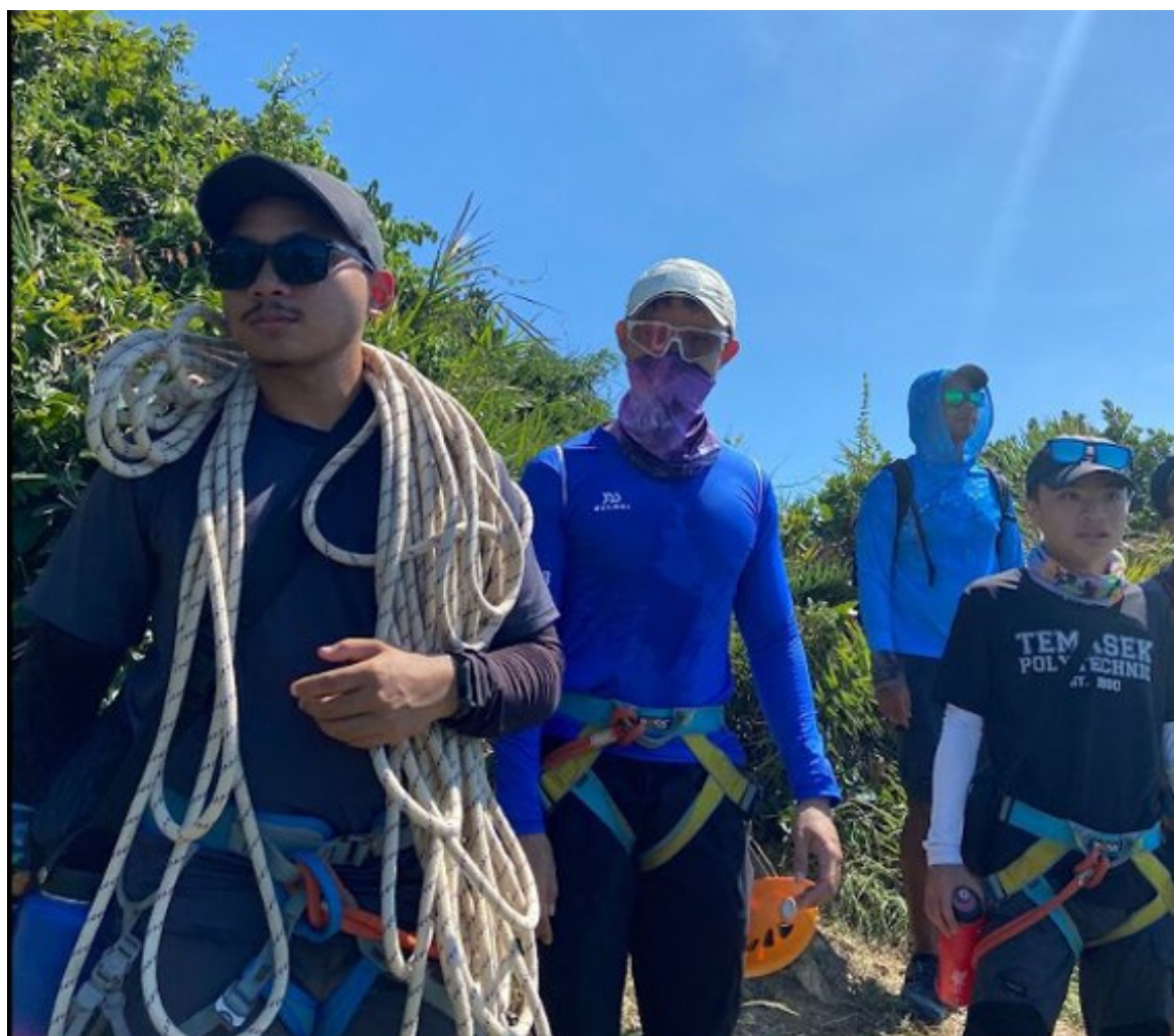
Interns setting up the outdoor abseil site

One of the most memorable aspects of their experience was the experimentation with new approaches and tackling the unique terrains found in Vietnam.