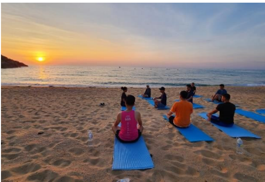
Participants at a morning yoga session with Outward Bound Vietnam

From 23 - 25 June 2023, Outward Bound Vietnam successfully held a leadership building course for staff at managerial levels and young leaders from Hikvision. This tailored corporate course focuses on developing individuals' understanding of their ability to work with others, in problem-solving and decision-making, and teamwork & ability to collaborate, using our unique educational method – “learning and experiencing” following the Experiential Learning Cycle model.