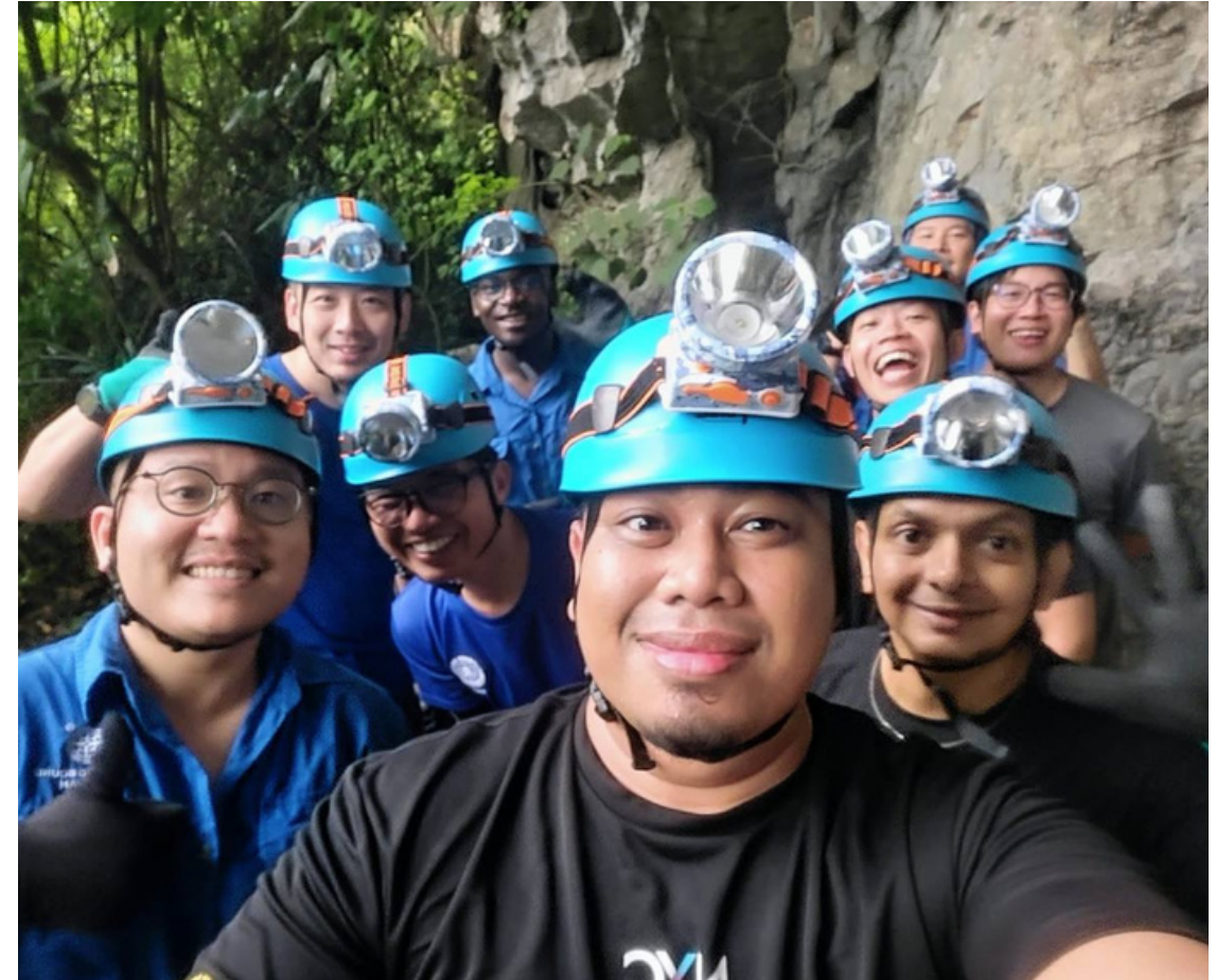
OBS team visiting OBV sites for due diligence purpose, 16 – 22 July 2023