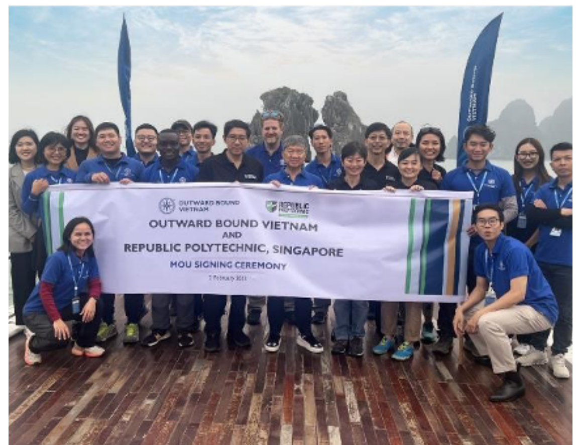
MOU Signing Ceremony between OBV and RP, February 2023