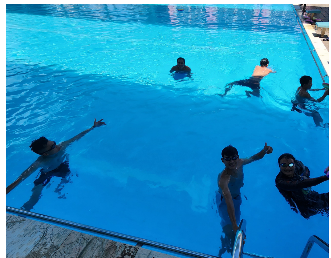
Water Proficiency and Lifesaving training