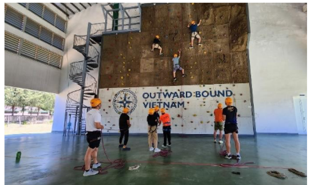
Hikvision staff participating in Indoor Rock Climbing activity