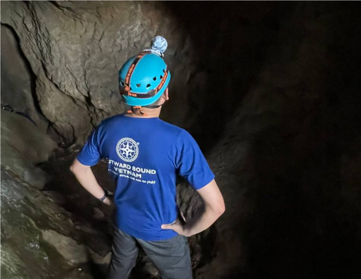
Exploring the caves of Ha Long

As part of our strategic partnership efforts, a group of OBS delegates visited OBV Ha Long and OBV Binh Dinh from 16 to 22 July to see the feasibility of conducting a joint programme in Vietnam. The trip also serves as an initial affirmation of OBV's readiness and capability to potentially host participants from Singapore soon.