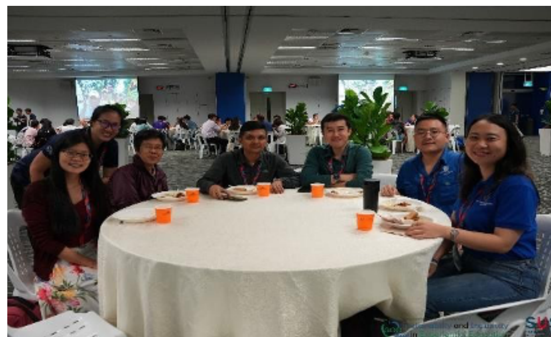
OBV Team at the inaugural AEE Asia Pacific Region Conference 2023