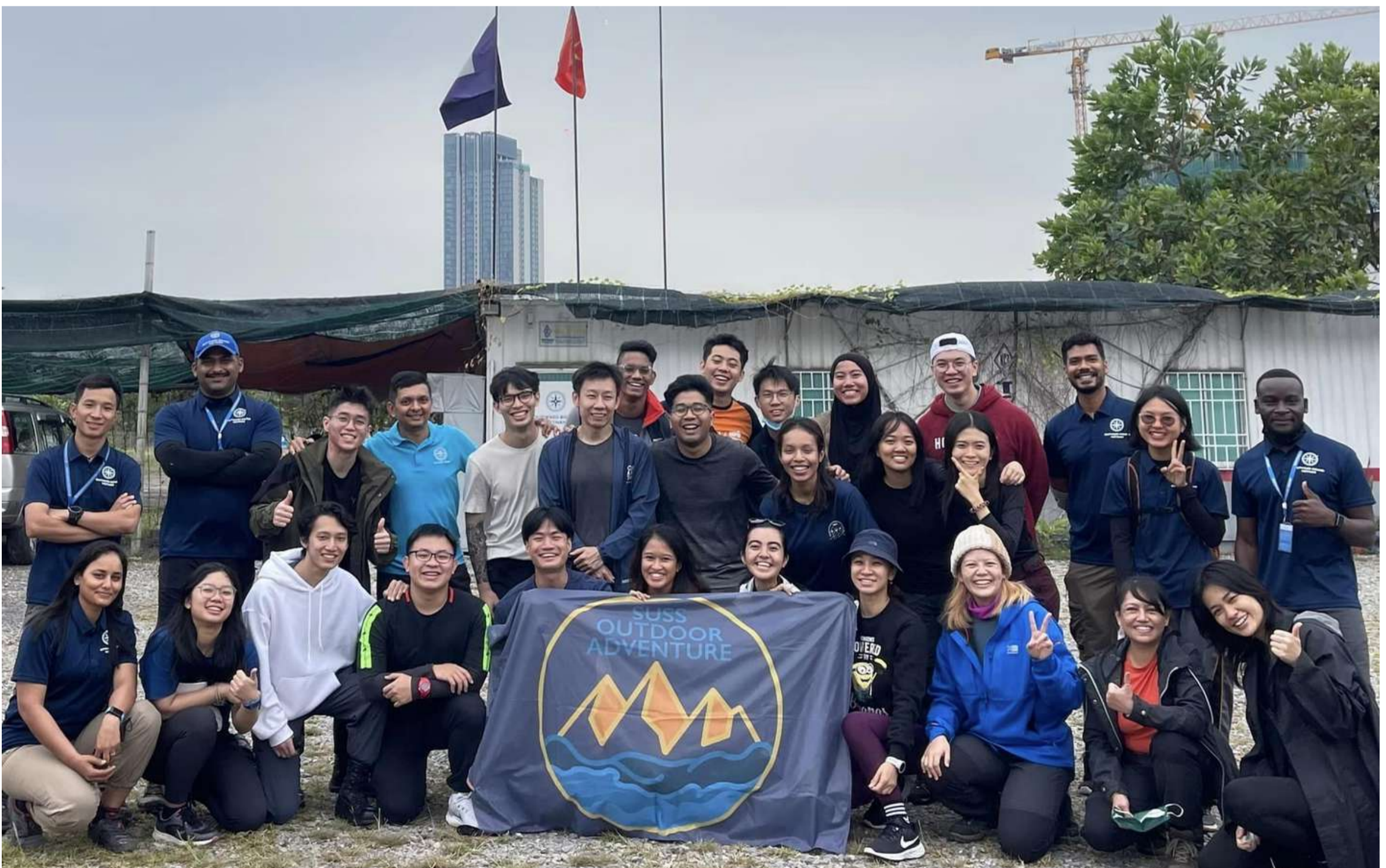
SUSS students group photo with OBV Executive Director and Instructors at the official programme opening