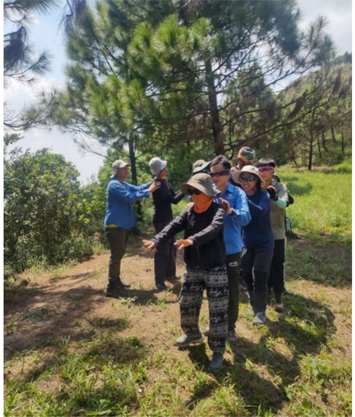
Nature Bound Games and Initiatives Training