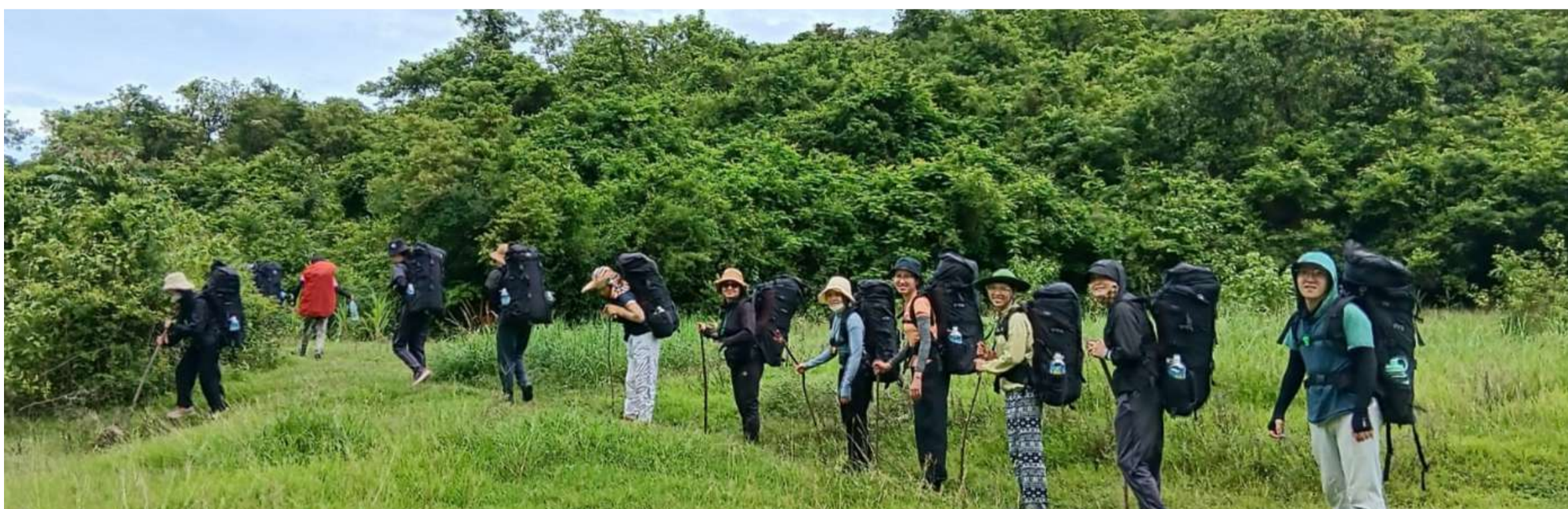
KinderWorld International Group (KIG) staff on their hiking expedition @ OBV Binh Dinh

From 11 to 15 October, OBV was poised to continue our commitment by delivering programmes for diverse KIG staff cohorts spanning various branches and divisions throughout Vietnam. KIG places paramount importance on staff development, recognizing it as the pivotal catalyst for business expansion and enduring corporate progress. Therefore, we meticulously designed the programmes to enhance team effectiveness, communication, and problem-solving skills. Such acquired skill sets has proven to be effective in improving employee performance and promoting excellence at work to create a dynamic and cooperative work environment.