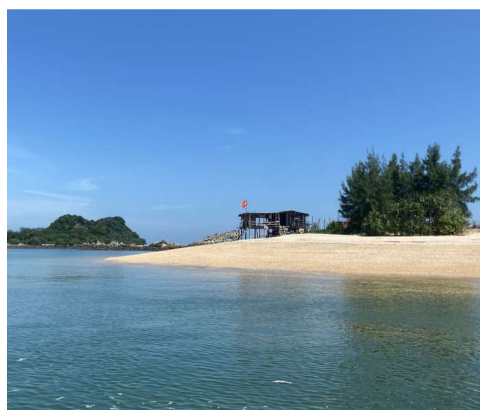
The Cai Chien Island area