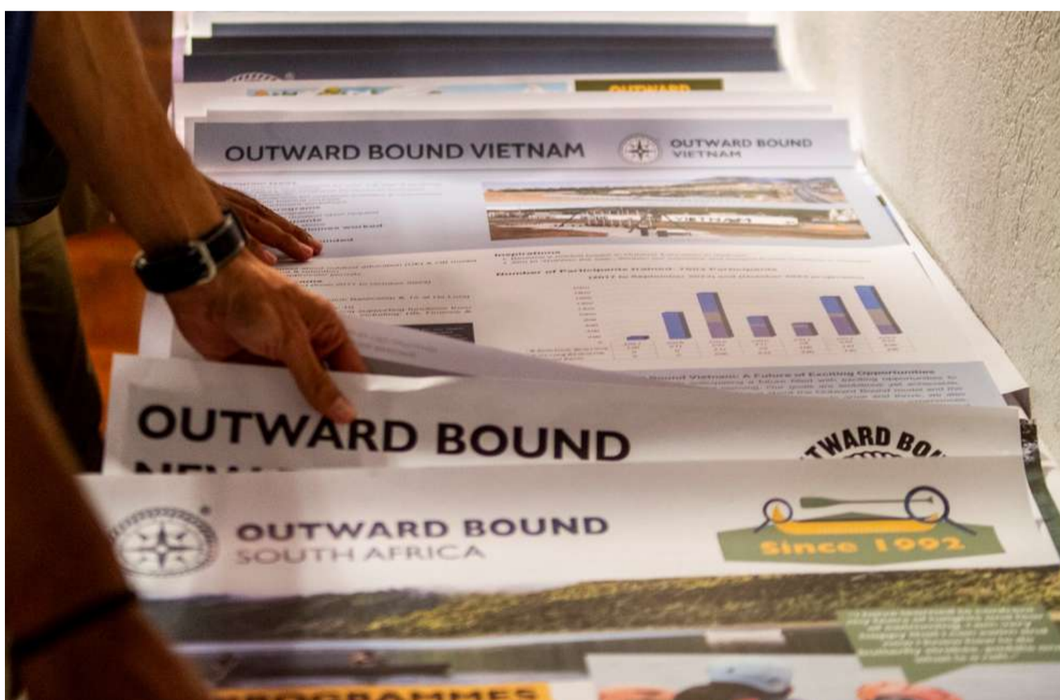
OBV Poster Presentation Session