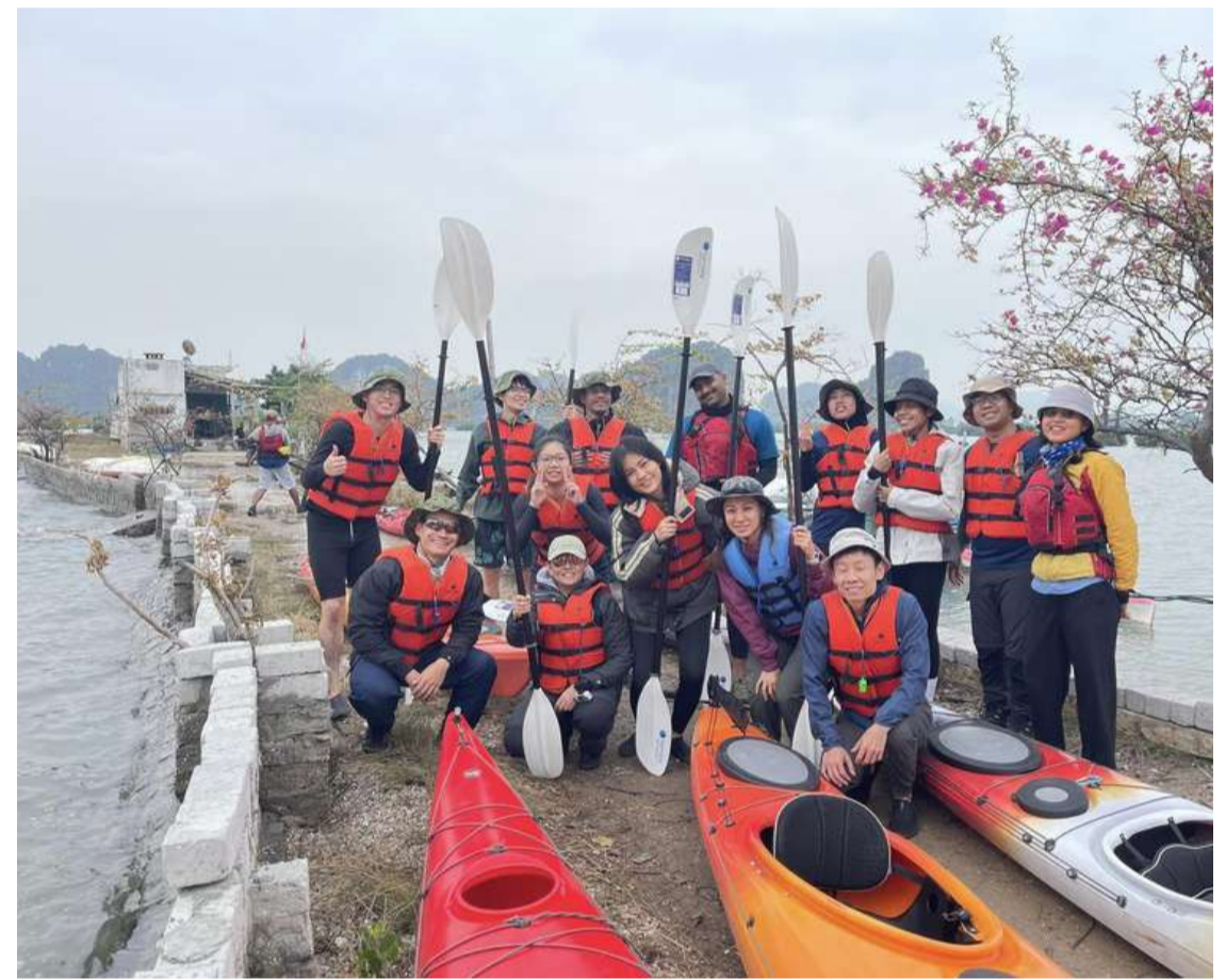
SUSS students commencing on their Kayaking expedition @ OBV Ha Long