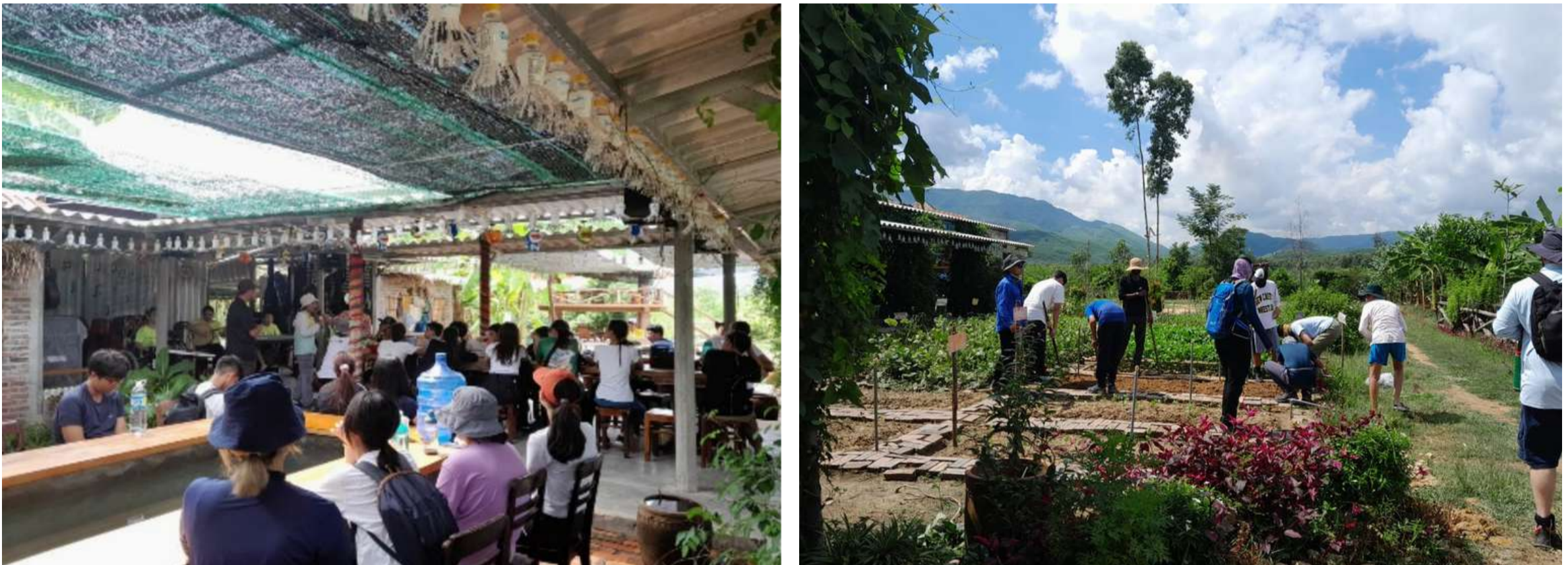
EIS students during Service-Learning activity @ OBV Binh Dinh

OBV hosted 86 Year 8 & Year 9 students of European International School HCMC (EIS) from 2 to 6 October for an outdoor adventure at our Basecamp in Binh Dinh. For Year 8, the programme focused on self-reliance, social skills, and service learning, while the Year 9 programme emphasized on developing leadership, resilience, and cultural understanding. Both groups were involved in a range of outdoor activities, from service learning to adventure challenges (e.g. abseiling, kayaking), with an intent to foster personal growth and raise community awareness.