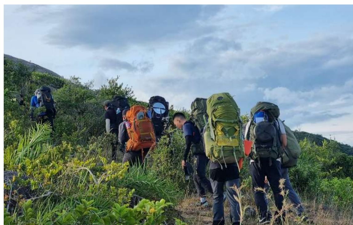
Staff Expedition in Binh Dinh