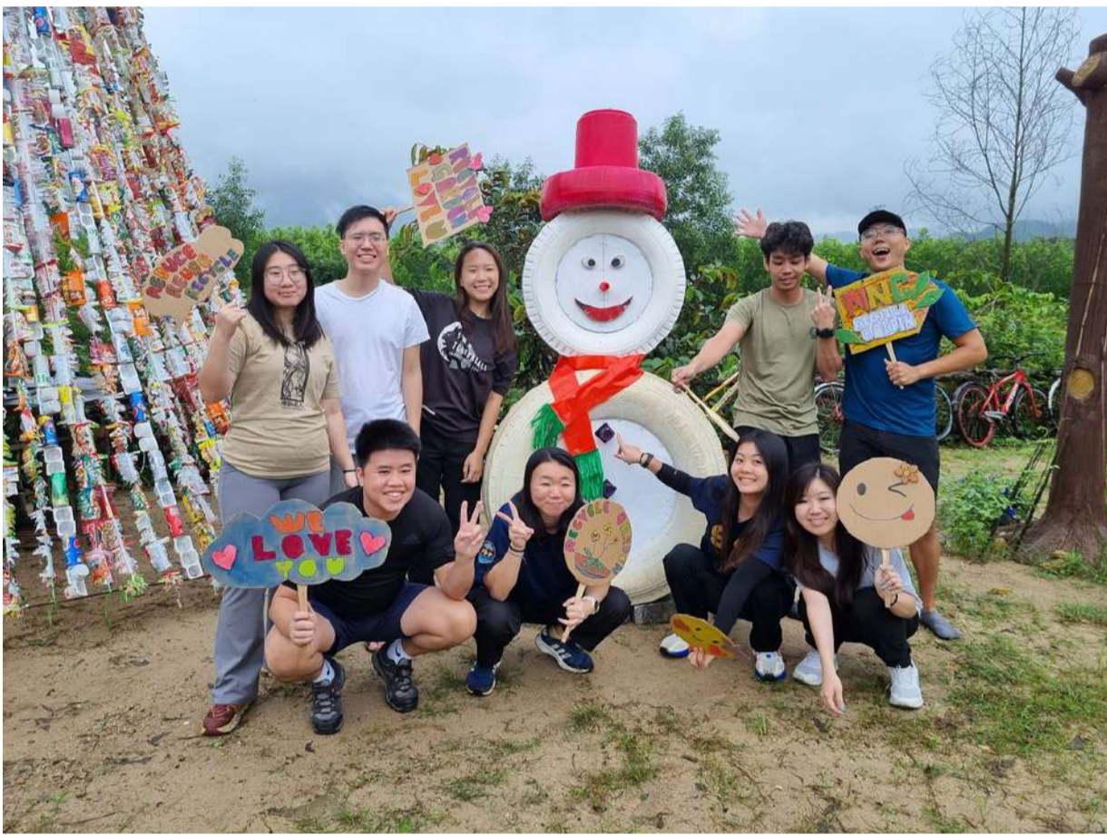
SUSS students in the community service engagement organized by OBV Binh Dinh & Nguyen Nga Center for young people with disabilities

From 30 November to 7 December, OBV hosted SUSS students aged between 22 – 42 for a 7-day programme at our Basecamps in Binh Dinh and Ha Long. The programmes were specially designed to give participants an impactful expedition-based outdoor adventure education programme as well as raise awareness of Vietnamese craftsmanship & culture. In addition to taking on challenges like abseiling, rock-climbing, kayaking, jungle navigation etc., the participants also undertook ecological and community service engagements. Cumulatively, the combination of outdoor education pedagogy and cultural immersion engagements for the participants helped promote youth networking to understand the similarities and differences between Vietnam and Singapore.