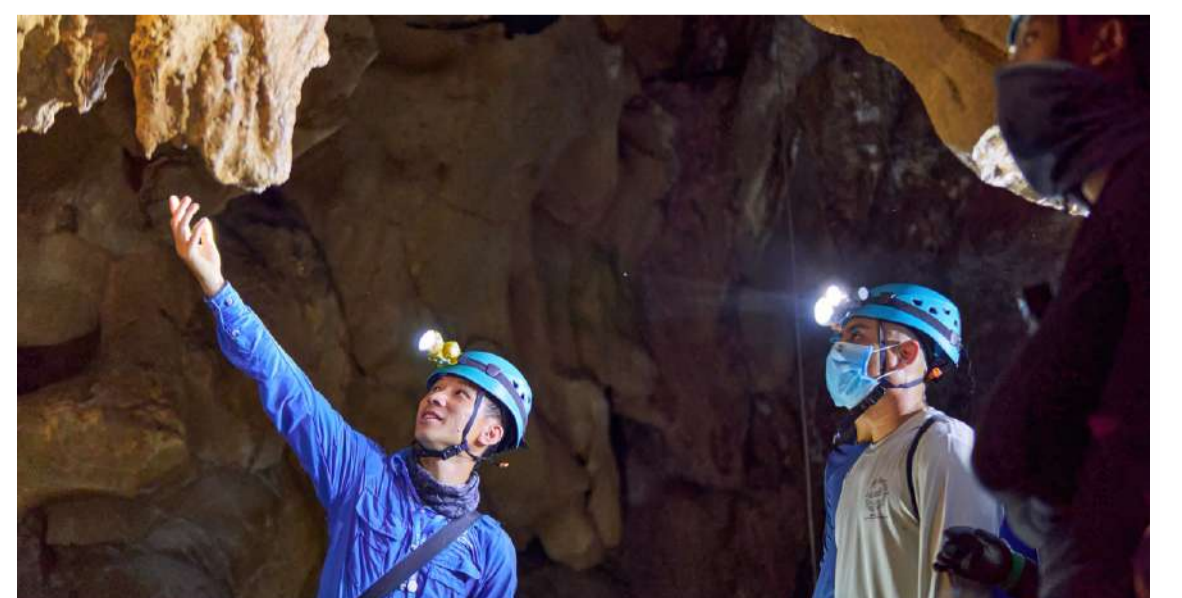
RP students exploring caves @ OBV Ha Long