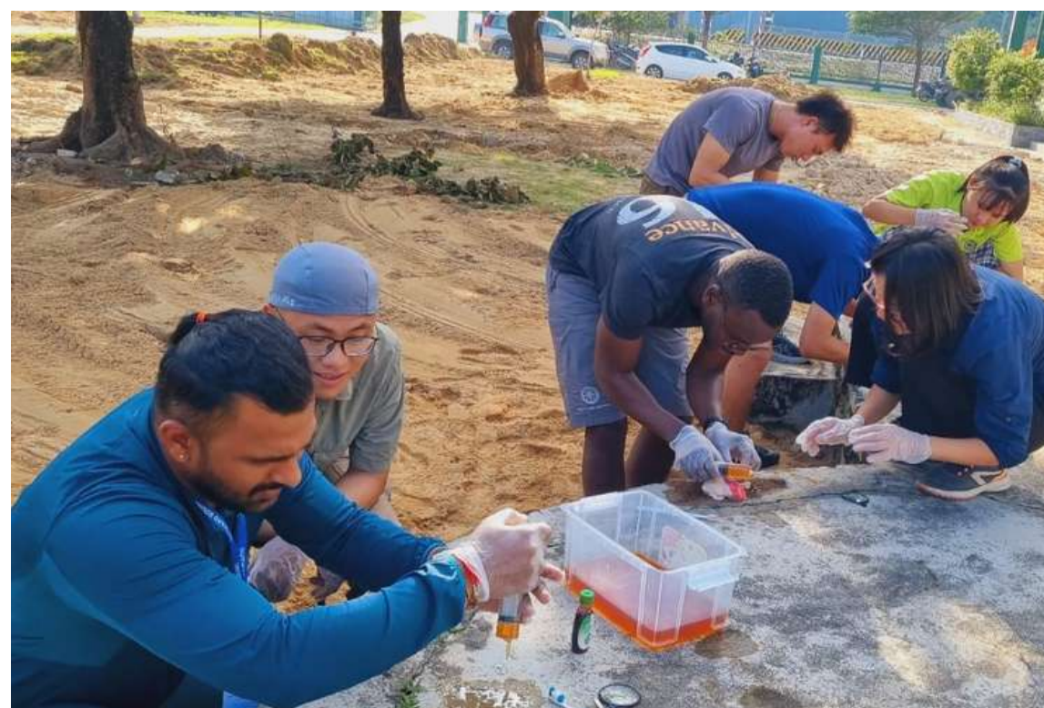
Wilderness Advanced First Aid (WAFA) Training conducted in OBV Binh Dinh by Viristar