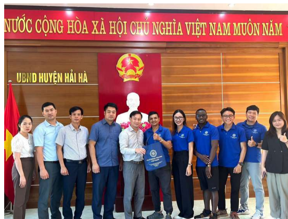
OBV team met with Hai Ha District Senior Officials in October