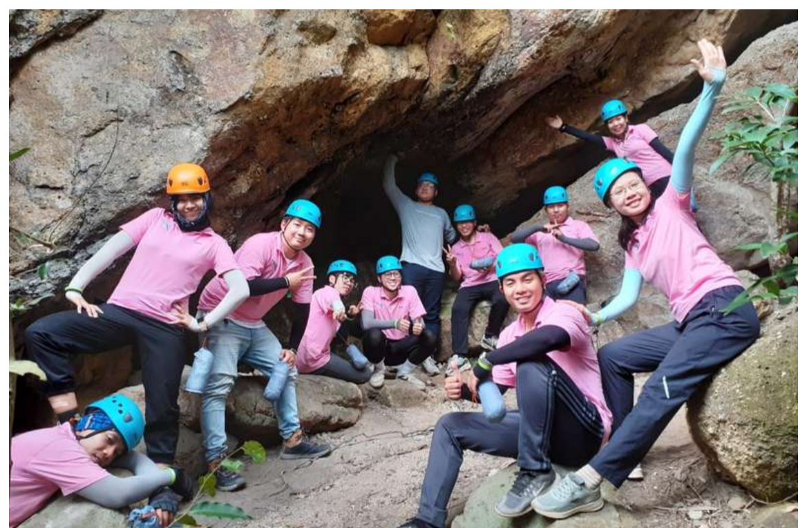
MiTek Vietnam staff hiking and cave exploration activities @ OBV Ha Long