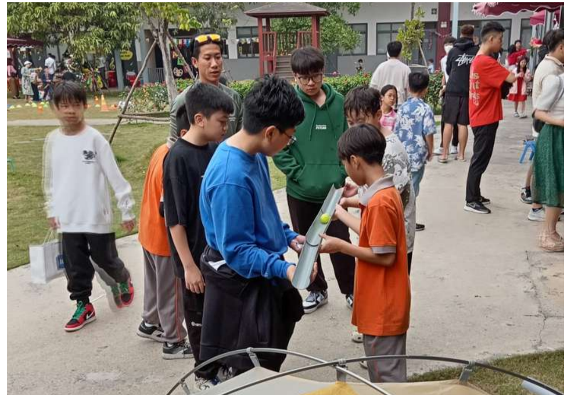
Students of SIS Ha Long participating in the games and initiatives organized by OBV Ha Long at the Christmas Fair