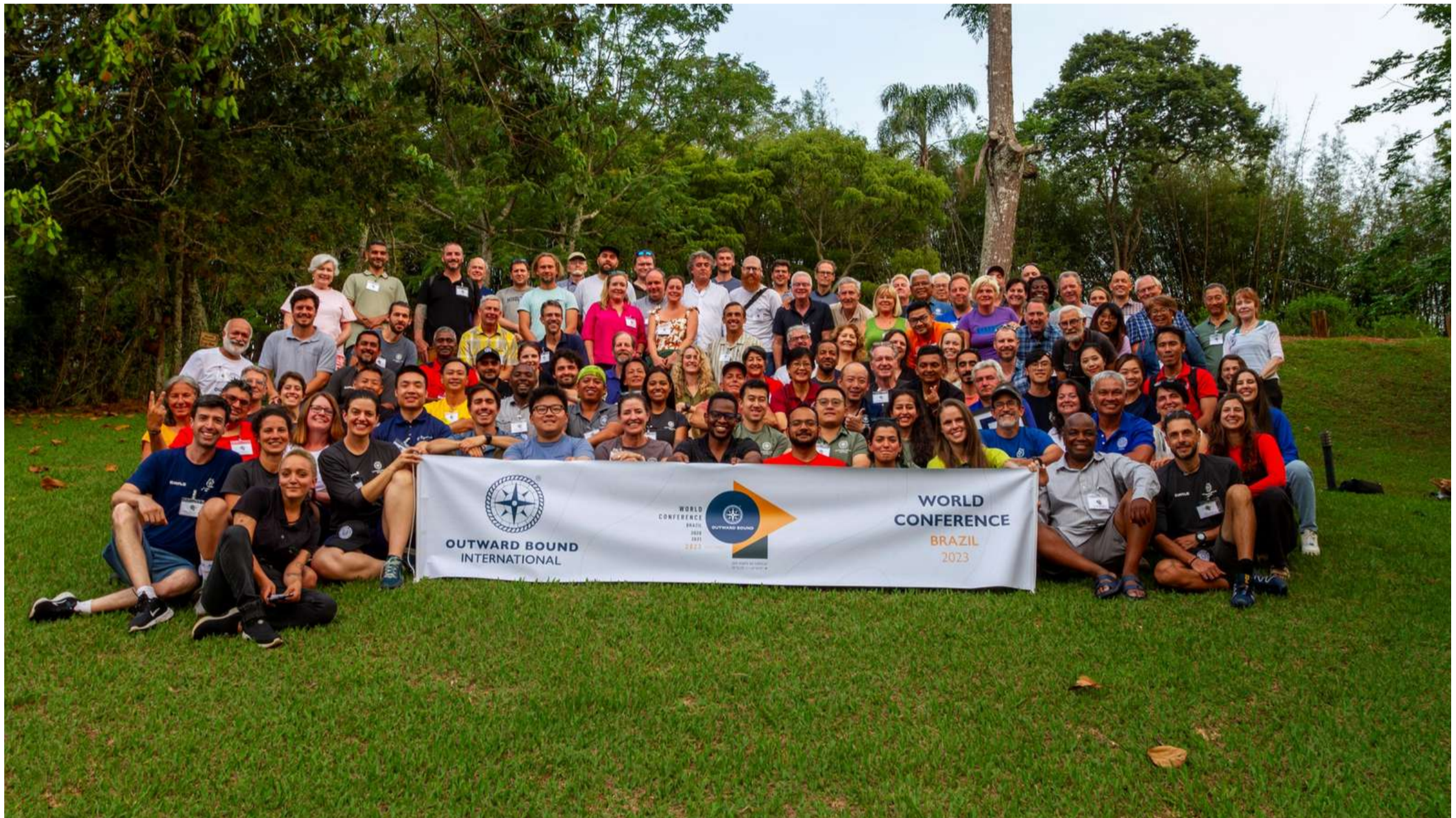
About 100 international delegates from OB schools around the world attended the Conference