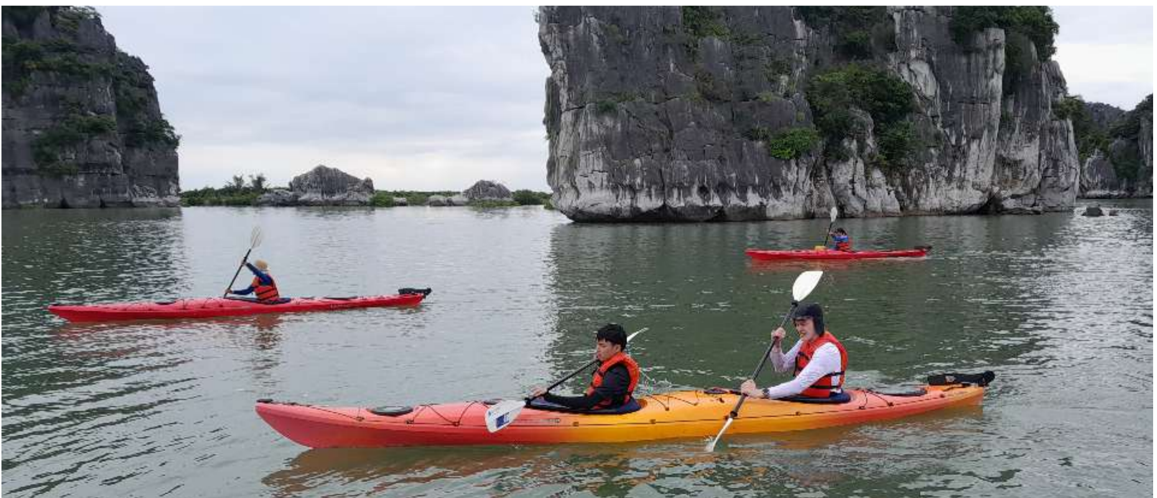
QSI International School Hai Phong students on their kayaking expedition @ OBV Ha Long

High school students from QSI International School Hai Phong joined a 4-day OBV expedition from 9 to 12 October in Ha Long, with the focus on developing self-perseverance in challenging situations and effective communication skills. The course also emphasized social responsibility and taking accountability for one's actions. Throughout this transformative journey, students engaged in diverse activities, including camping at a historic Pagoda, abseiling down a cliff face, hiking, acquiring kayak skills, and working through team challenges. The programme concluded with a final challenge and programme review, allowing students to reflect on their experiences, making this journey an essential step of their personal growth and raising of their social consciousness.