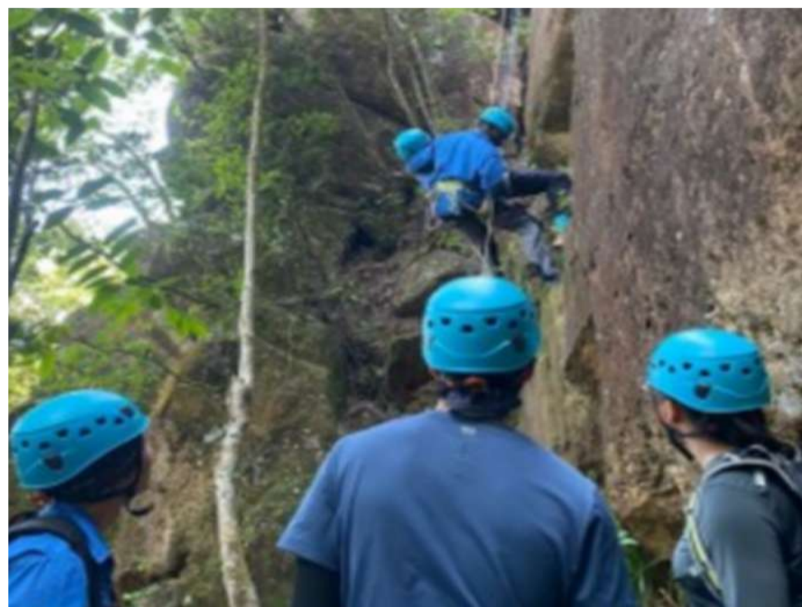
Abseil Rescue Training