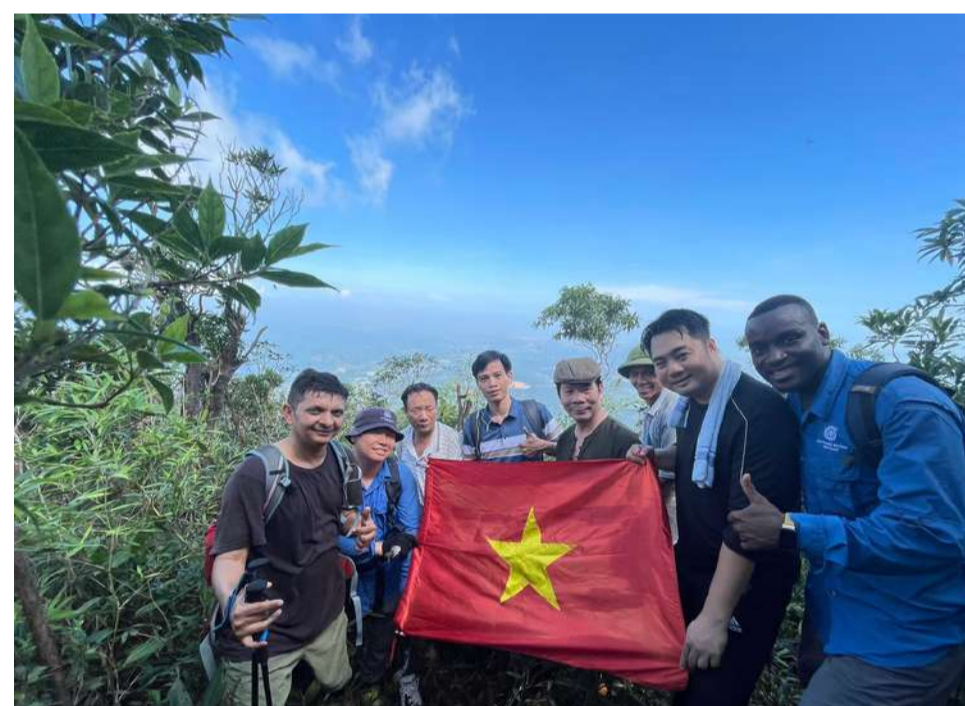
OBV recce team exploring the Duc Mountain terrain