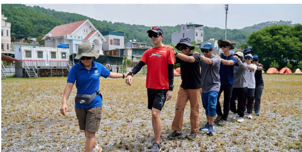
RP students attempting Team Initiatives @ OBV Ha Long

OBV welcomed the students from Republic Polytechnic Singapore to join our course in the stunning Ha Long area. Over the span of 7 enriching days - from 11 to 17 September; participants immersed themselves in thrilling activities like hiking through scenic trails, conquering outdoor abseiling, mastering camp craft, embarking on rock hiking, navigating the tranquil waters through kayaking, exploring caves, setting up camp, engaging in night reviews and reflection. The tailored programme was a holistic experience that left students with a deeper understanding of leadership, an enhanced capacity for planning and organizing, better teamwork, and a commitment to community development and environment sustainability.