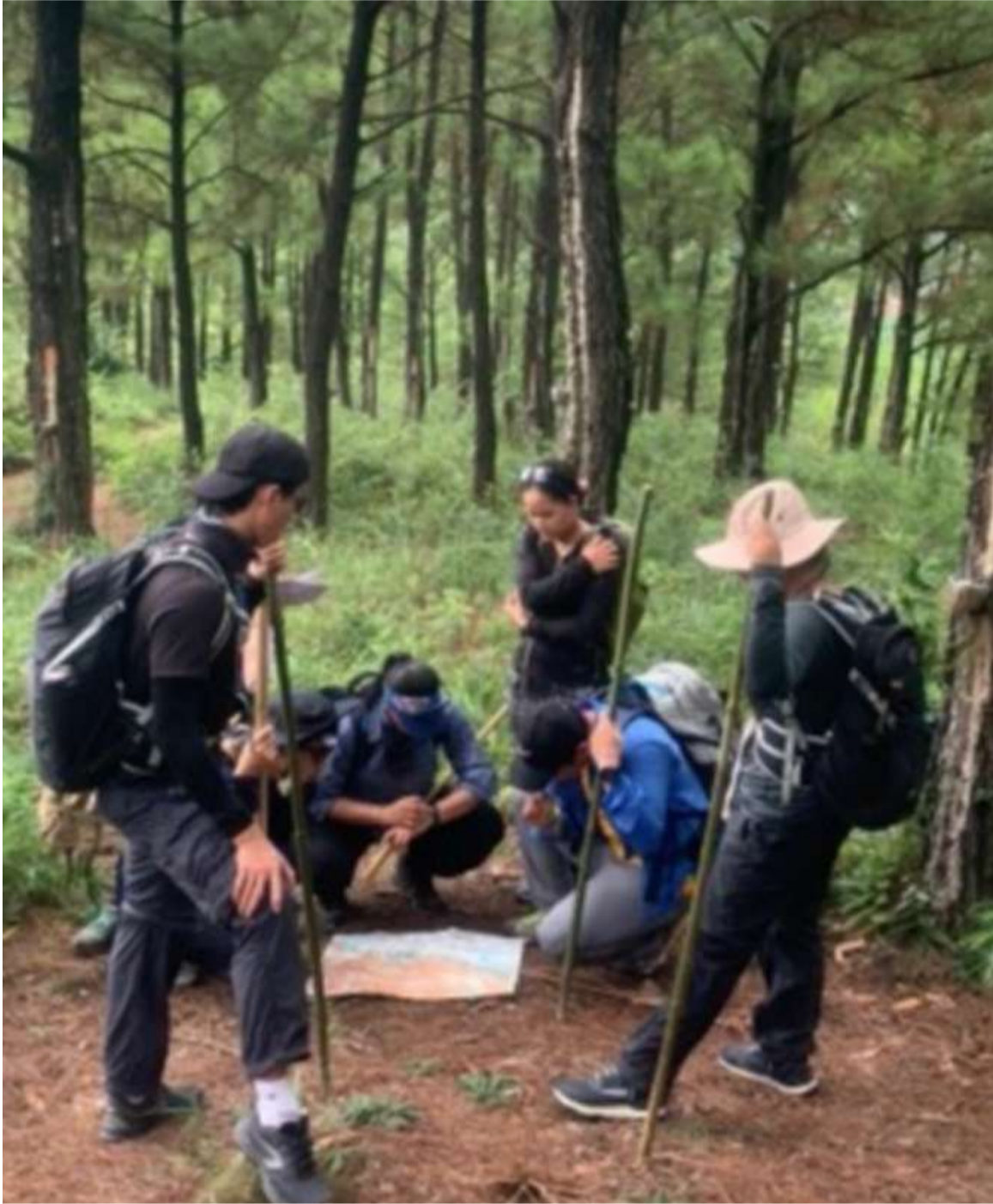
Recce & Advanced Navigation Training

While site recce and developing new hiking trails were the focus for the quarter, staff in Ha Long Base still found time to refresh on their Facilitation skills, including understanding Outdoor Education Learning Models and structuring learning experiences. There were also more resources and activities developed for programme planning. More advanced caving lessons incorporating ecological literacy and advanced abseil rescue techniques were also conducted, though updated lesson plans and curriculum.