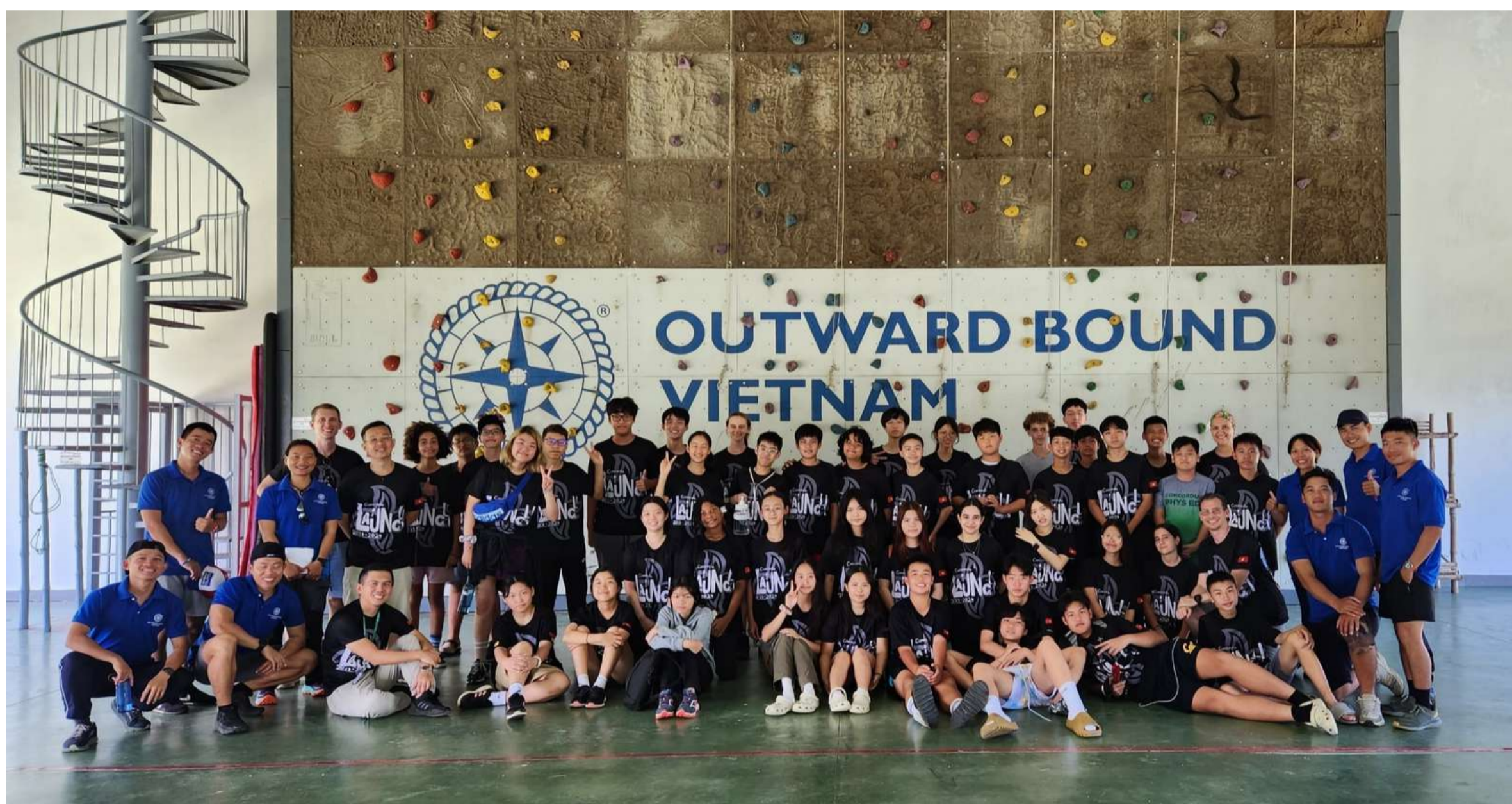
Concordia International School Hanoi students @ OBV Binh Dinh

The Concordia student development programme, held from 25 to 29 September, offered a developmental experience to 43 enthusiastic participants in Grade 8 at Concordia International School, Hanoi. Over the course of 5 adventure-packed days at the serene Binh Dinh Base, students engaged in many exciting activities, including indoor wall climbing, outdoor abseiling, raft building, rafting, and low-ropes challenges. The activities pushed participants both personally as well as a team, allowing them to identify their strengths to overcome physical and mental challenges. The course enabled the holistic development of the students by fostering bonds, raising socio-emotional awareness, motivation to excel, and becoming confident in public speaking.