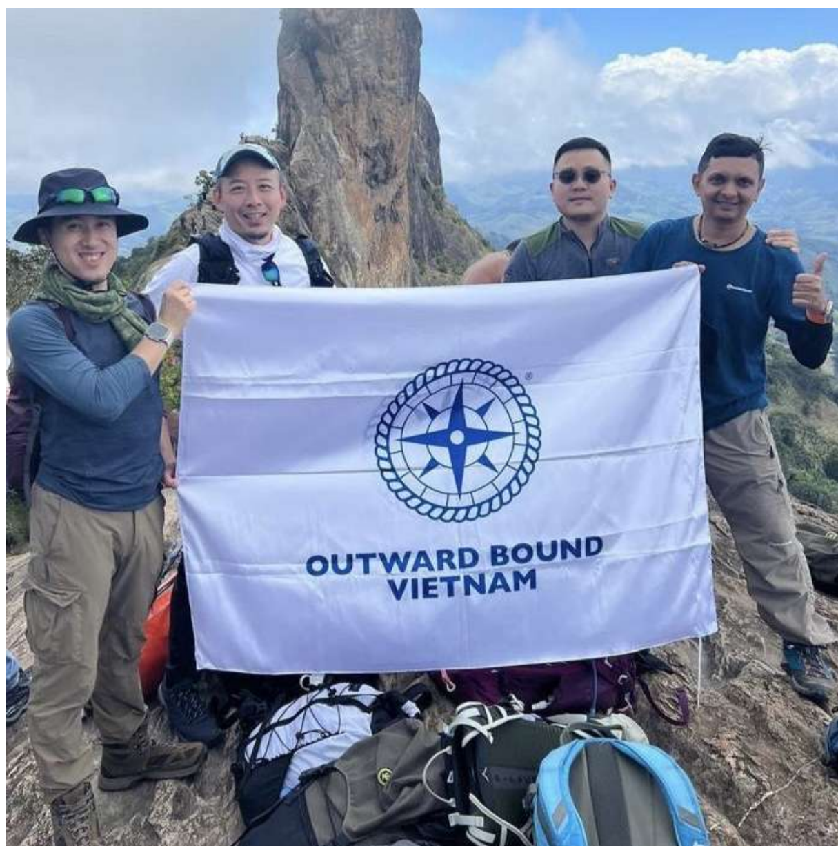
OBV delegation near the summit of Pedra do Pauzinho, Brazil as part of the Pre-conference activity