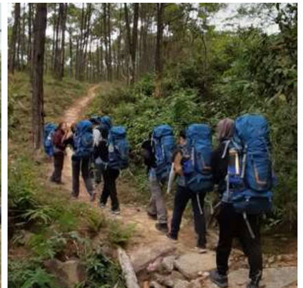
SUSS's students embarking on their hiking adventure at OBV Ha Long