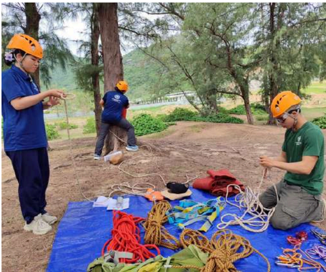
Rope Activities set up (Indoor wall climbing & Tyrolean traverse)