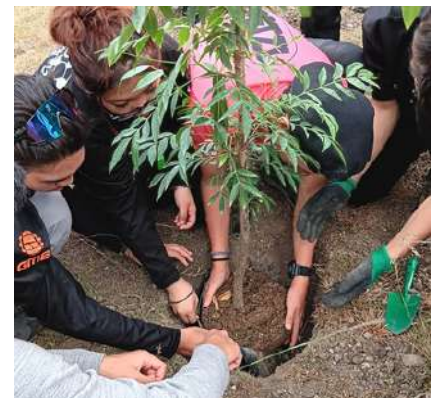
RP's students in tree planting activity as part of Environmental Stewardship at OBV Ha Long basecamp

Students from Republic Polytechnic (RP) in Singapore ventured to Ha Long with OBV, embarking on an adventure filled with challenge, discovery, and connection to nature from December 5 – 12. Through activities like abseiling, hiking and kayaking, participants engaged in eight days of self-discovery, growth and adventure. This immersive programme focused on developing key life skills such as leadership, teamwork, and communication, along with promoting environmental stewardship and social responsibility. As they returned home, RP students carried with them more than memories; they were equipped with the skills, confidence, and purpose to make a positive difference wherever they go.