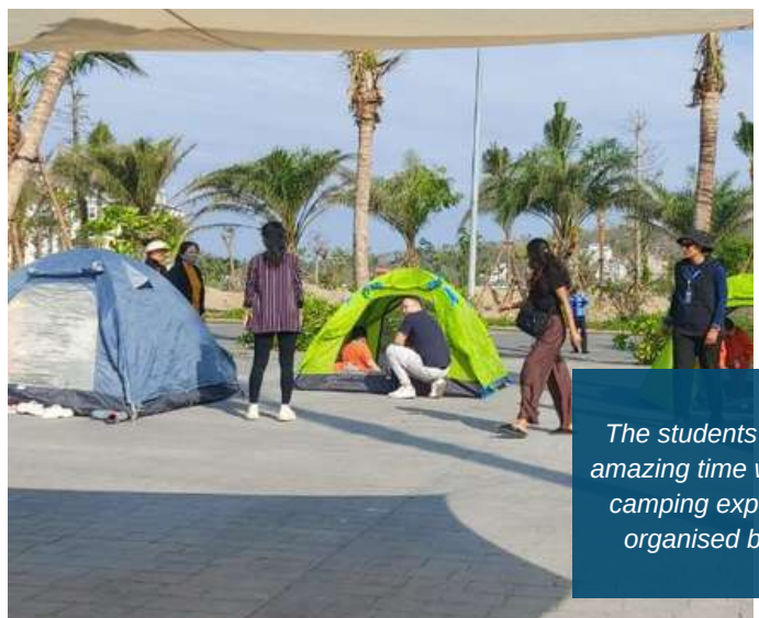
The students had an amazing time with the camping experience organised by OBV

On November 28, OBV Ha Long team supported the Earth Day event at Singapore International School (SIS) Ha Long for their Kindergarten students. The theme "A Day at the Beach" included activities like Passing the Ball, Musical Rings, and Freeze Dance. OBV set up a day camping experience by the beach where students enjoyed time in tents, built sandcastles, and participated in team games. The event was a delightful success, celebrating nature and outdoor exploration!