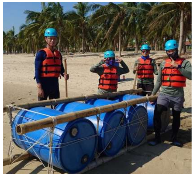
Improvised Rafting and Water Activity Management Training