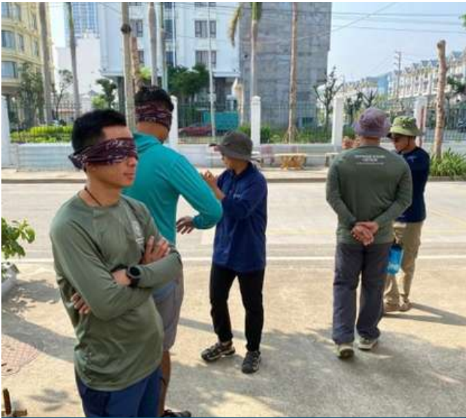
Activity Briefing & Facilitation

In addition, we held annual Skills Refresher sessions alongside site clean-up activities for technical areas such as Abseiling, Caving, Raft Building, and Advanced Hiking & Navigation. These efforts are all part of our commitment to continuous improvement and readiness as we move forward with our programmes at OBV Ha Long.