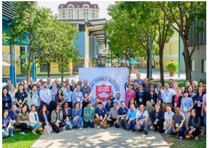
About 60 delegates from schools and organisations attended the two-day ASISS Conference