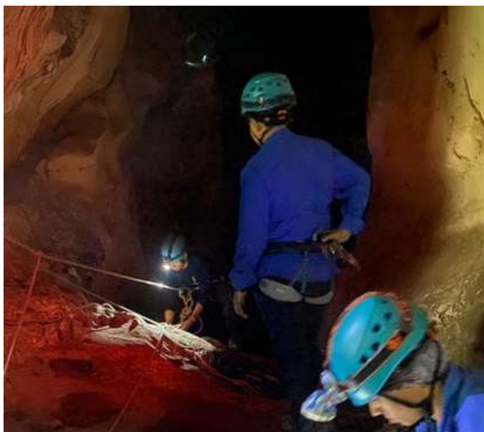
Cave Abseil Set-up Training