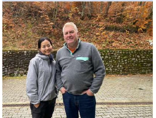
OBV delegates in hiking expedition to Gurghiuului Moutain, Sovata, Romania, as part of the Pre-Symposium activity