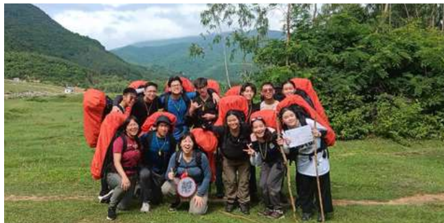
Temasek Polytechnic's students kicked off their hiking expedition amidst the stunning mountainous landscapes of Binh Dinh, Vietnam