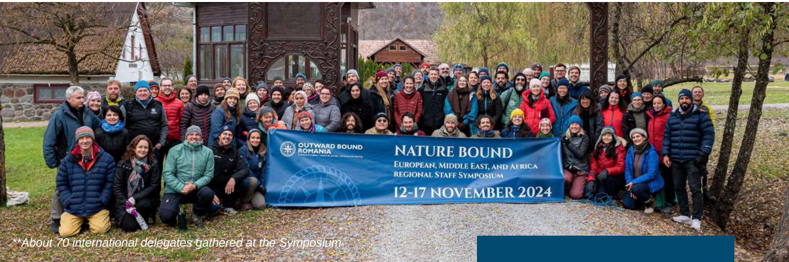
**About 70 international delegates gathered at the Symposium.