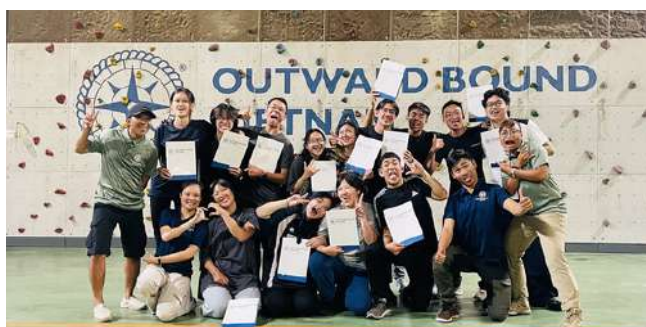
Certification Ceremony for students of Temasek Polytechnic @ OBV Binh Dinh basecamp