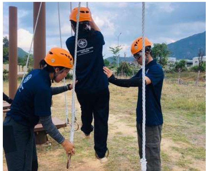
Setting up and running Low Ropes Activity