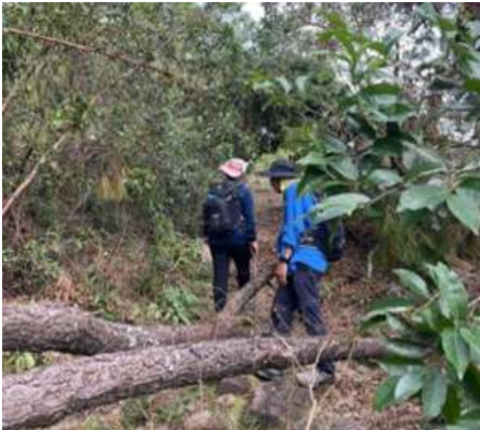
Hiking Training & Risk Assessment

The impact of Typhoon Yagi in September this year, which primarily affected Quang Ninh and Ha Long, required significant adjustments to our scheduled programmes and training. We redirected resources and efforts to salvage and conduct risk assessments in preparation for programmes in late November. Despite the challenges, we seized the opportunity to enhance our training approach to be more realistic and purposeful, focusing on practical skills to improve both programme delivery and staff capabilities. Key training included Hiking, where we reassessed risks and hazards along commonly used trails, as well as Kayaking training to strengthen personal and group management competencies for water activities. We also focused on developing Facilitation skills to ensure impactful programme delivery.