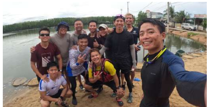
Climbing & Abseiling Proficiency Level 1&2 Training and Certification by OBS