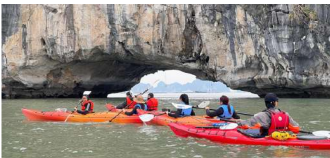
SportCares Singapore team on an exhilarant eight-day adventure at OBV Ha Long