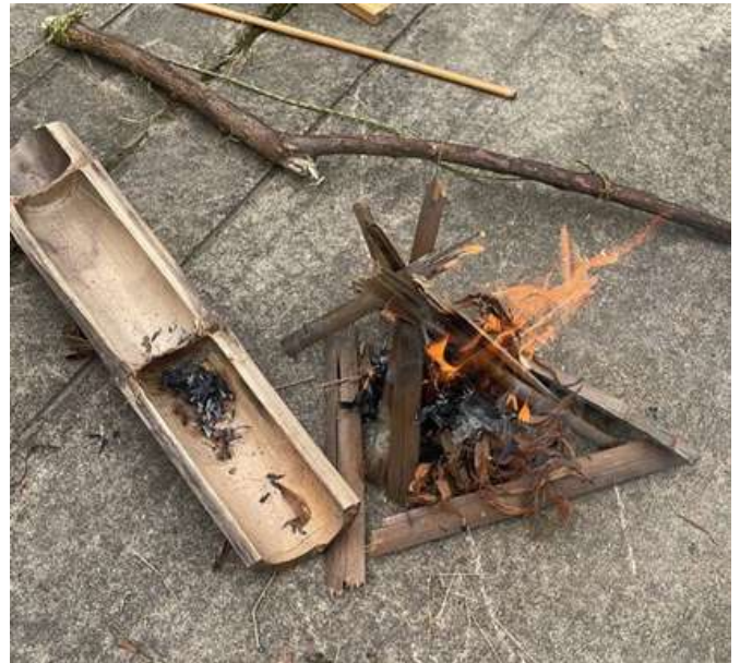
Bush-Craft Activities for Programmes