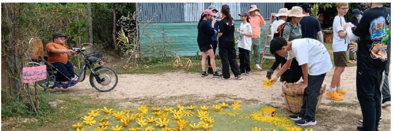
Concordia International School's students engaging in a community service project at the Nguyen Nga Center for young people with disabilities, a long-term partner of OBV

Students engaged in activities such as wall climbing, abseiling, hiking, and raft building, pushing themselves beyond their limits, building resilience, and forming stronger bonds with peers. These hands-on experiences not only provided practical skills but also deepened their appreciation for the environment and their role in it. We also hosted the corporate team-building programme for staff of KinderWorld International Group, focusing on communication, collaboration, and problem-solving through challenges that mirrored workplace dynamics. The tailored OBV programmes helped participants foster resilience, teamwork, and skills that extend beyond OBV to enhance their work culture. OBV believes that our impactful programmes will continue to inspire and empower participants to grow and make positive contributions to the community.