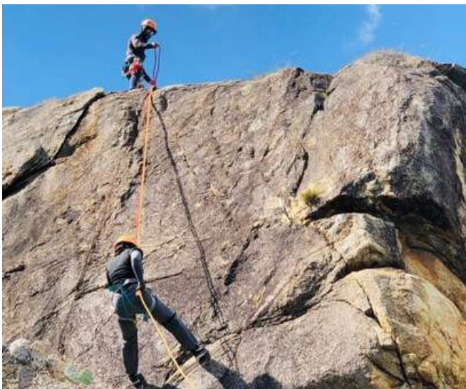
Outdoor Abseiling Training

In addition to these skills, our trainees have also focused on developing vital instructional soft skills, including group management, environmental skills, safety and risk management, and foundational facilitation techniques. We are proud of their progress and look forward to seeing them excel in their roles as outdoor education leaders!