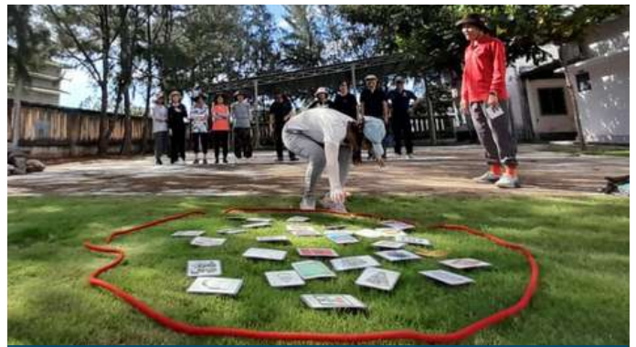
OBV's tailored team-building programme for staff of KinderWorld International Group

Over the last quarter of this year, OBV also had the pleasure of hosting several local international schools, including Concordia International School, International School of Ho Chi Minh City-American Academy (ISHCMC-AA), and International School of Ho Chi Minh City (ISHCMC), for transformative outdoor programmes at our basecamps.