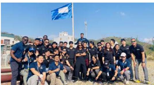
Course Opening Ceremony for RP at OBV Ha Long basecamp

"Our students were really excited to come for this programme and I am sure they surpassed their own expectations when it came to dealing with the challenges of the cooler climate of North Vietnam and moving from campsite to campsite, while experiencing interesting adventures along the way. I certainly hope more RP students will get to experience the natural splendours of North Vietnam through OBV."