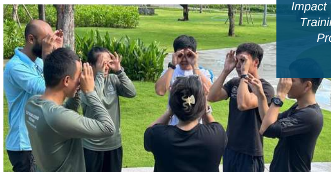
Impact Teaching Training by our Programme Manager