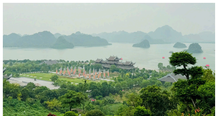
OBV team exploring the stunning Tam Chuc Complex for future programme opportunities