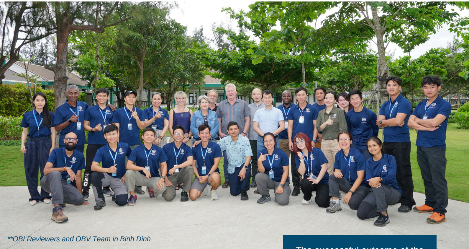
**OBI Reviewers and OBV Team in Binh Dinh