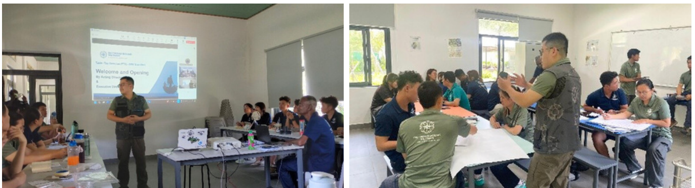
Opening remarks by OBV Deputy Director and collaborative scenario discussions at OBV Binh Dinh

Safety remains at the heart of everything we do at OBV. Recently, our Binh Dinh base organised a Table-top Exercise (TTX) focused on incident management and strengthening our response to potential situations during outdoor activities. The exercise brought together staff from various departments to work through real-life scenarios in a structured, discussion-based format. This collaborative setting enabled our teams to develop effective strategies, clarify roles, and strengthen both communication and teamwork in high-pressure situations. Insights and feedback gained from this TTX are also instrumental in enhancing our operational readiness and ensuring the safety of our participants.