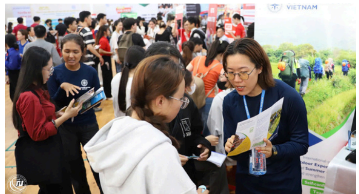
OBV team showcasing exciting career opportunities to the students of Quy Nhon University at the Job Fair

On 17 May, OBV was delighted to participate in the annual Quy Nhon University (QNU) Job Fair. As a long-standing partner of QNU, we remain committed to creating meaningful employment opportunities for the youth of Quy Nhon and Binh Dinh province.