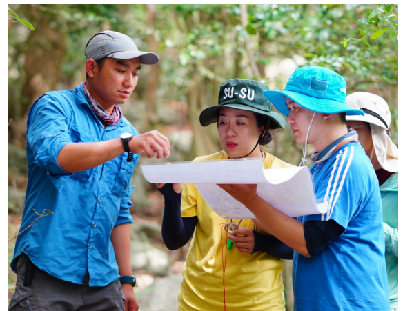
KIG staff taking on the navigating challenge in Binh Dinh

From January to June 2025, OBV had the privilege of welcoming back trusted partners from both school and corporate groups, including the Singapore International School (SIS) network, QSI International School of Hai Phong, KinderWorld International Group (KIG), and Swing for Kids Scholarship programme. Each tailored programme provided customised experiential learning opportunities, from team-building challenges to community engagement and environmental exploration, all designed to foster personal growth, resilience, and leadership among participants.