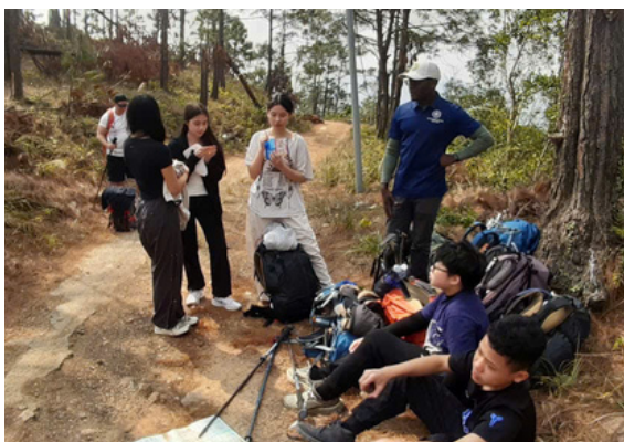
Brighton College Vietnam (Hanoi) students on a hiking expedition as part of their DofE – Bronze programme in Ha Long

From 18 to 19 January, OBV Ha Long proudly partnered with Brighton College Vietnam (Hanoi) to deliver our first Duke of Edinburgh (DofE) programme—an exciting milestone in the expansion of our educational offerings. The DofE Award is a globally recognised programme that not only fosters self-development and confidence but also provides valuable accreditation for future academic and career opportunities. Throughout the adventurous journey in Ha Long, Brighton College Vietnam (Hanoi) students carried their own gear, trekked through challenging terrain, set up camp, and cooked their own meals—demonstrating remarkable determination, perseverance, and strong team spirit.