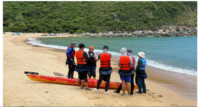
Hands-on training led by OBS Trainer, covering paddle handling, launch techniques, sea condition assessment, and more at OBV Binh Dinh

"It was a real privilege to spend two weeks with the passionate and dedicated team at OBV Binh Dinh. Delivering the Kayaking 1 & 2 Star training course for the instructors was both energising and rewarding. What stood out to me was their eagerness to learn and how much they appreciated the structured approach, which helped break down their existing knowledge and experiences into clear, transferable skills. I'm grateful for the team's warm hospitality, our meaningful conversations and our shared learnings. I'm looking forward to seeing how our collaboration continues to grow in the years ahead!"