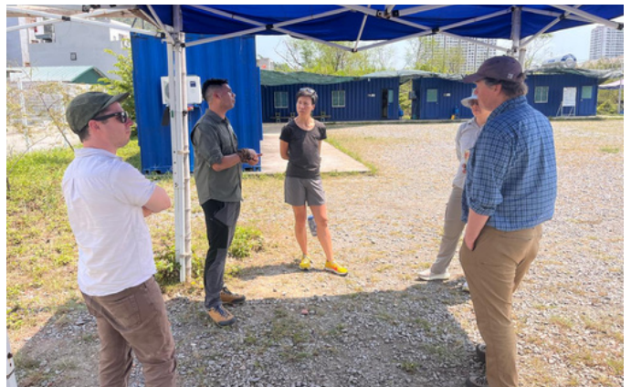
The AEE Reviewers visiting OBV Ha Long basecamp