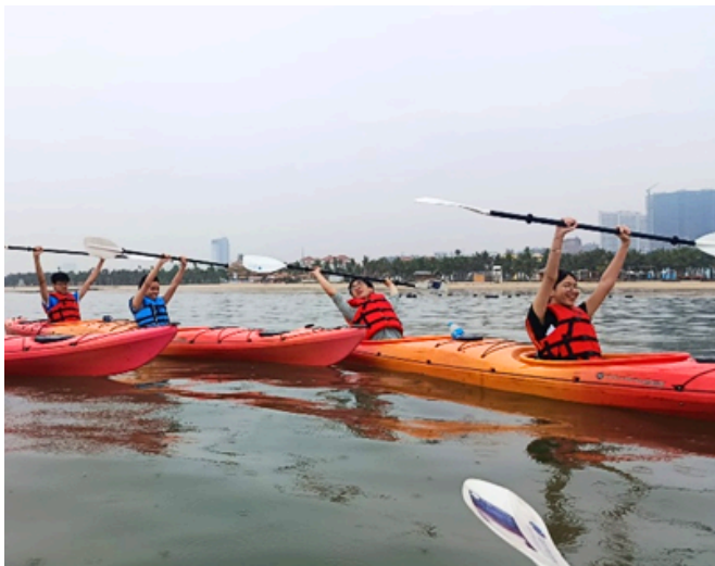
Delta Global School students conquering the kayaking challenge at OBV Ha Long

Over the first half of 2026, OBV welcomed participants from the Singapore International School (SIS) Network, Delta Global School, Brighton College Vietnam, Hoi An International School (HAIS) and more to a range of outdoor education programmes, including the Duke of Edinburgh's International Award Expedition.