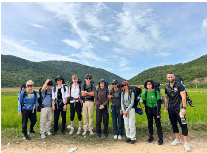
Students of Hoi An International School on their hiking expedition at OBV Binh Dinh

Through shared challenges, teamwork, and reflection, they developed confidence, resilience, leadership, and understanding of themselves, others and the world around them.