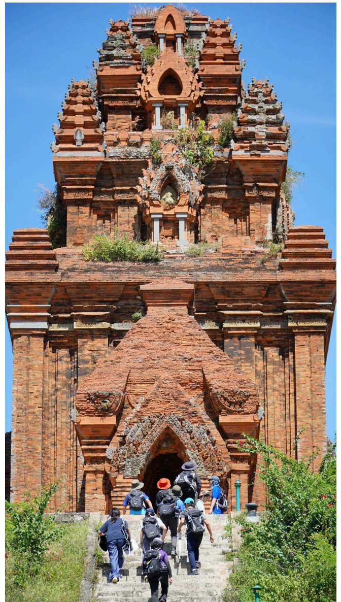
OBV participants entering the Champa Tower to explore one of Vietnam's rich cultural heritage sites

At OBV, we believe growth extends beyond adventure activities alone. In Binh Dinh, participants also had opportunities to explore local historical and cultural sites, including the Champa Towers, gaining new perspectives on the region's heritage and environment. By connecting adventure with place-based learning, participants were able to engage more deeply with both the landscape and the communities around them, enriching their overall learning journey.