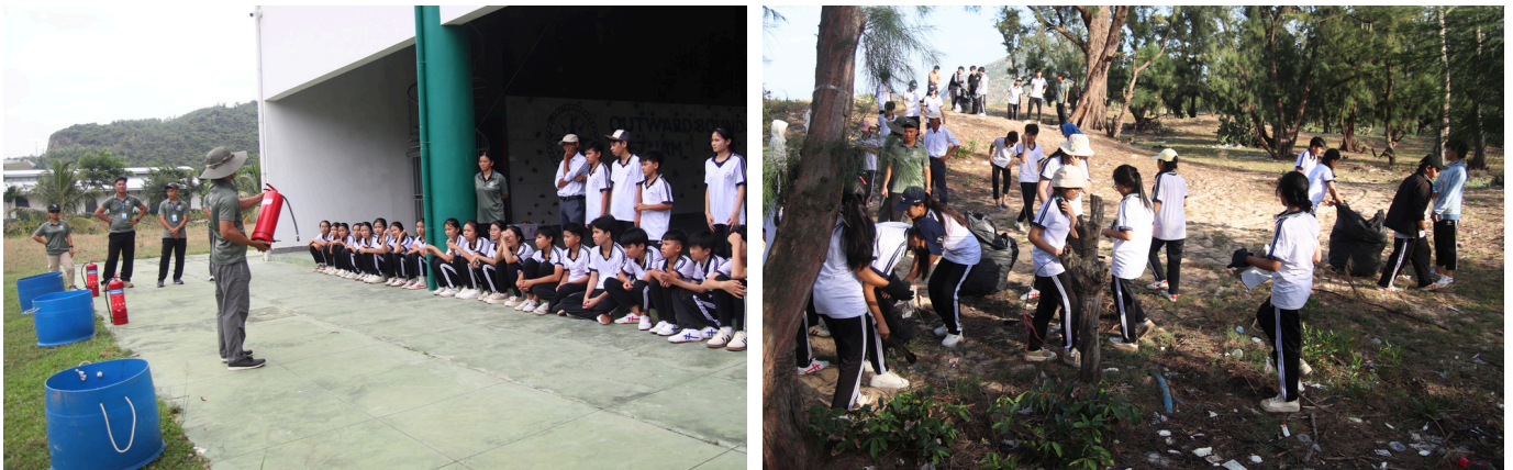
Safety Day for students of Cat Hai Secondary School, organised by the OBV Binh Dinh team at our basecamp

As part of OBV's Corporate Social Responsibility (CSR) efforts, our Binh Dinh team recently hosted a Safety Day for students from Cat Hai Secondary School. Through a series of interactive activities, students learned practical life skills related to beach safety, fire emergency response, teamwork, and environmental stewardship, including a beach clean-up initiative. We are delighted to support local youth in building knowledge, capabilities, and a sense of responsibility for both their own well-being and the environment.