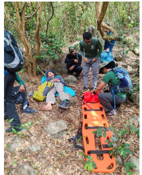
Left to right: Kayaking Skill Training, Technical Rope Skill (Tyrolean Traverse) Training & Evacuation Refresher @ OBV Binh Dinh